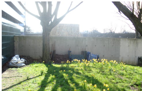
Here's a shot of how it looked before

If you have been walking along Alfred Road or towards the railway footbridge, you will have noticed that work is being done on the garden at Westminster Academy. Since last August, local resident volunteers have been growing vegetables, fruit, trees and flowers and generally improving the look of the green space.