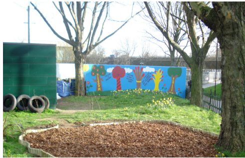
And here's a shot of how it looks today

Things have really begun to change again after a quiet winter. Funding of £450 from Capital Growth has purchased new tools (including a much needed wheelbarrow!) and hundreds of different seeds and plants. A day of corporate volunteering from DECC in March saw the garden being transformed with new hedging, an outdoor classroom, raised beds and a mural, which has brightened it up just in time for the new growing season.