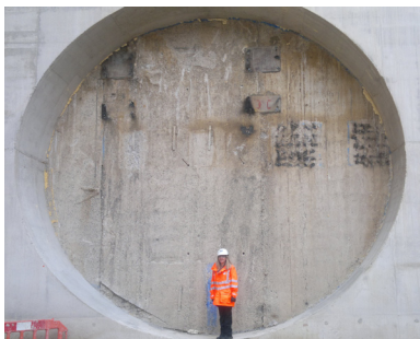
The Tunnel Boring Machine (TBM) and a crossrail worker standing in one of the portals